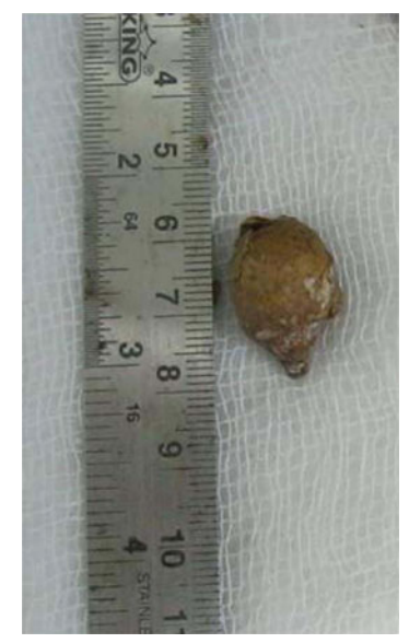
Fig. 2 Giant appendicolith

Department of Radiology, University College of Medical Sciences and Guru Teg Bahadur Hospital, University of Delhi, Delhi 110 095, India